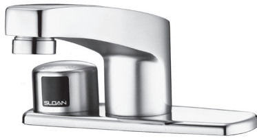
EBF-665 Deck Mount, battery ETF-660 Deck Mount, hardwired