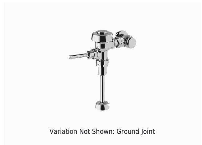
Variation Not Shown: Ground Joint